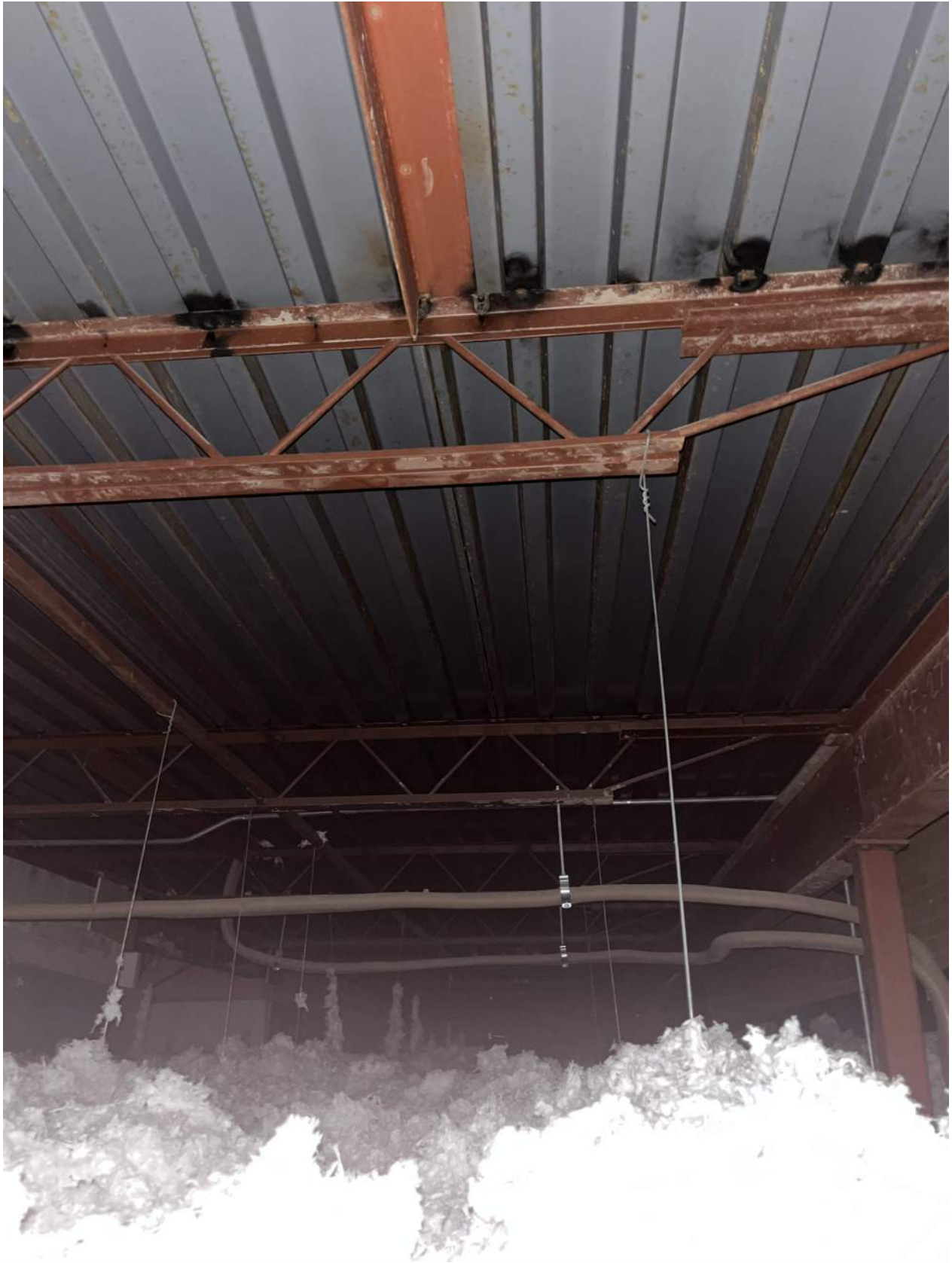
Photo #5 - Support of suspended ceiling on second floor in 1991 addition