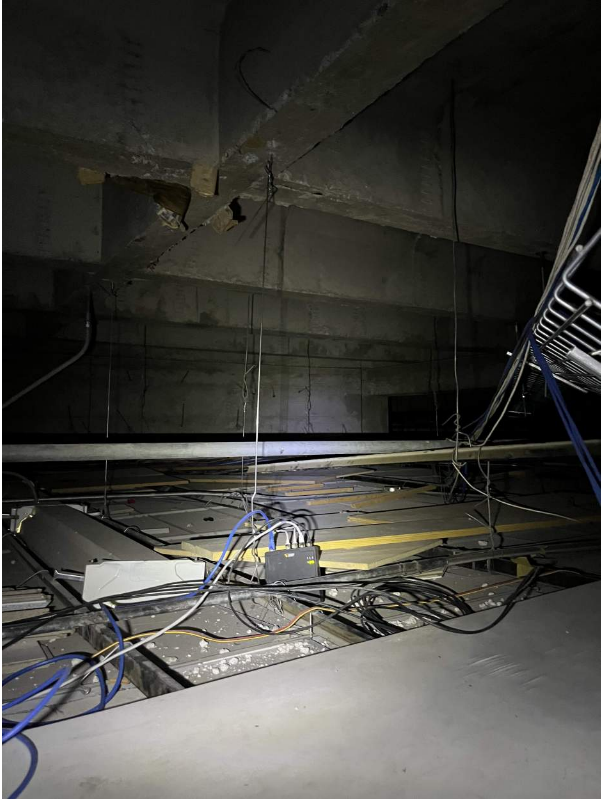
Photo #4 - Support of 1st floor suspended ceiling in section of original building